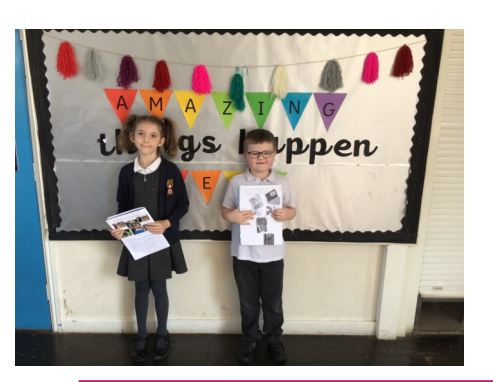
Years 5 & 6 produced some wonderful Tibetan artwork

Rosie produced some excellent writing independently Parker wrote about significant people