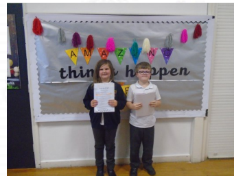
Ocean & Parker